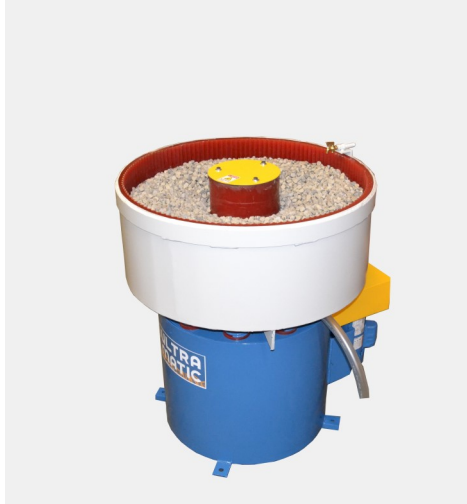
MODEL VB 3.5

Most Economical Bowl Machine on the Market. 110 Volt on off Switch, Solution Pump and Tank available.