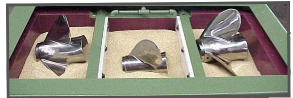
PROPS IN DRY POLISHING MEDIA. NOTE REMOVABLE TUB DIVIDERS